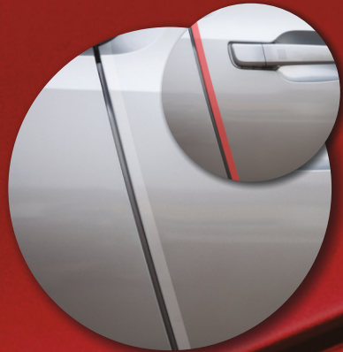
DOOR EDGE GUARD