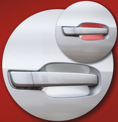
DOOR CUP GUARD